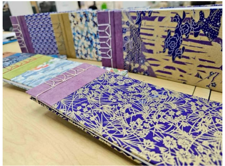
Japanese Book Binding - Adult Art Workshop