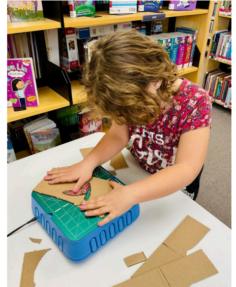
New ChompSaw - We are in love!