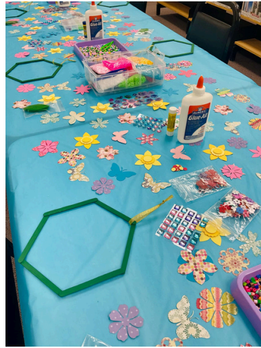
Perler Bead Adult Program