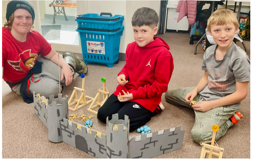
Catapult Build & Battle Program