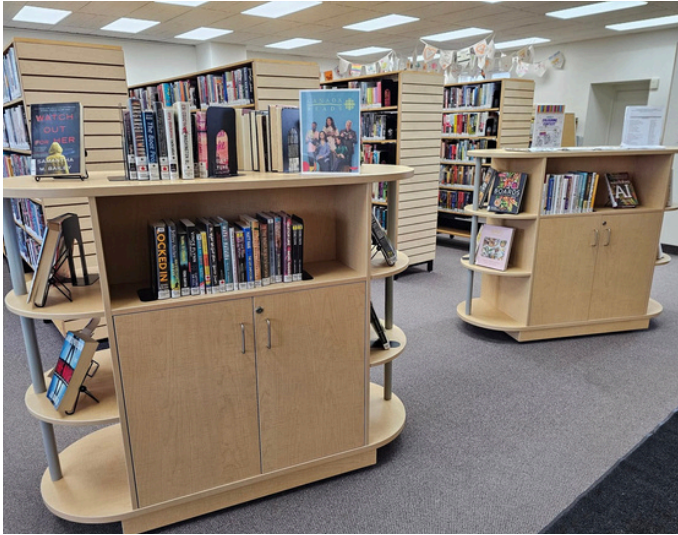
New Mobile Display Units