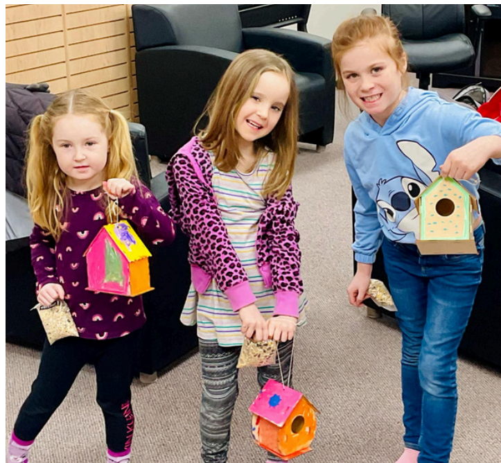
Bird House Building