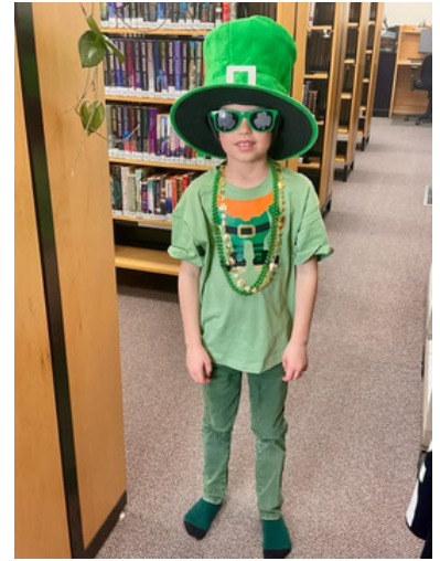
Leprechaun Party - March Break