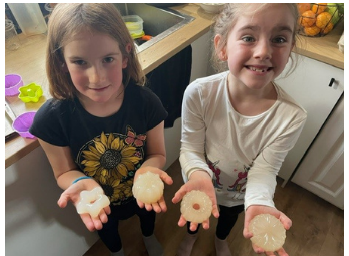
Take Home Kits - Jelly Soaps