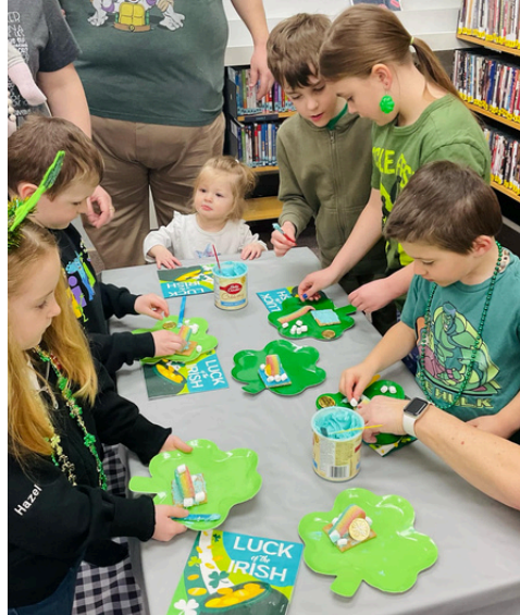
Over the Rainbow Treats