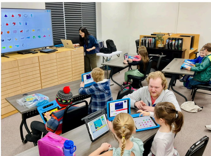
Virtual Ventures Technology Playground